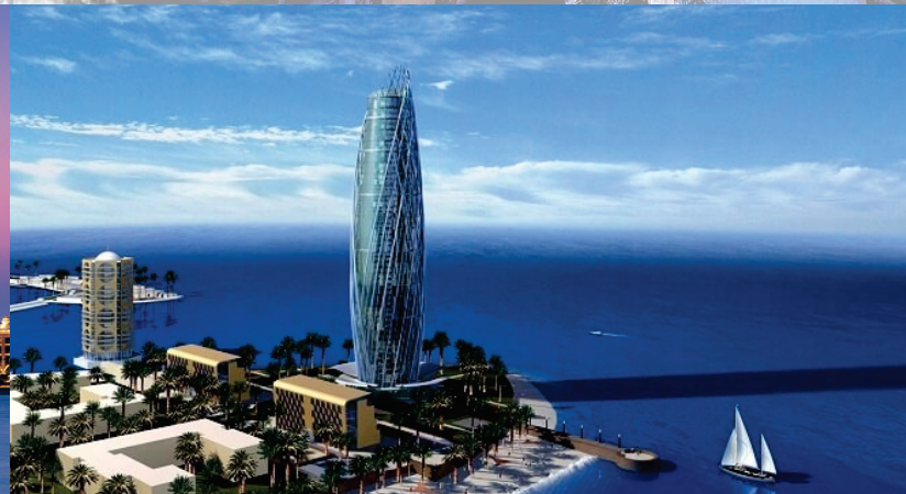
Flower of East, Iran