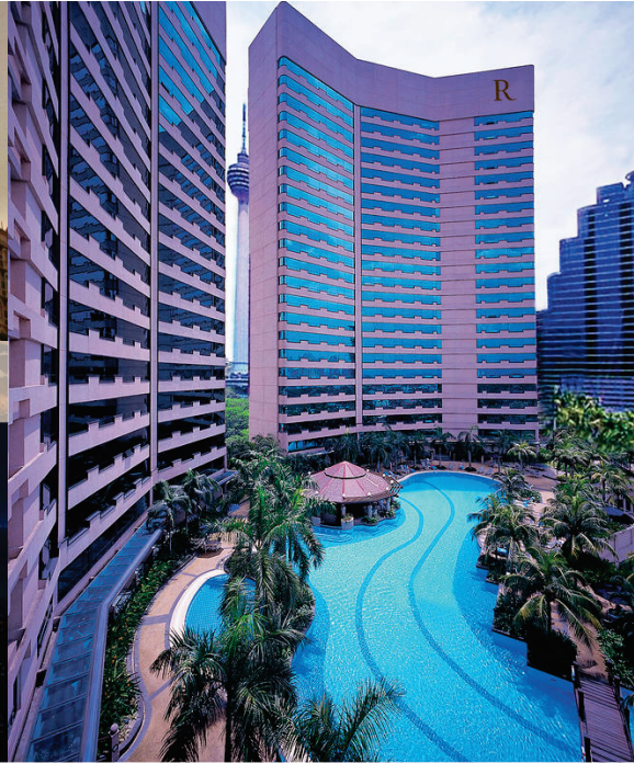
Renaissance Hotel, Kuala Lumpur