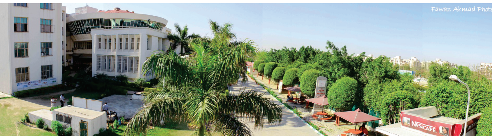
Fawaz Ahmad Photos