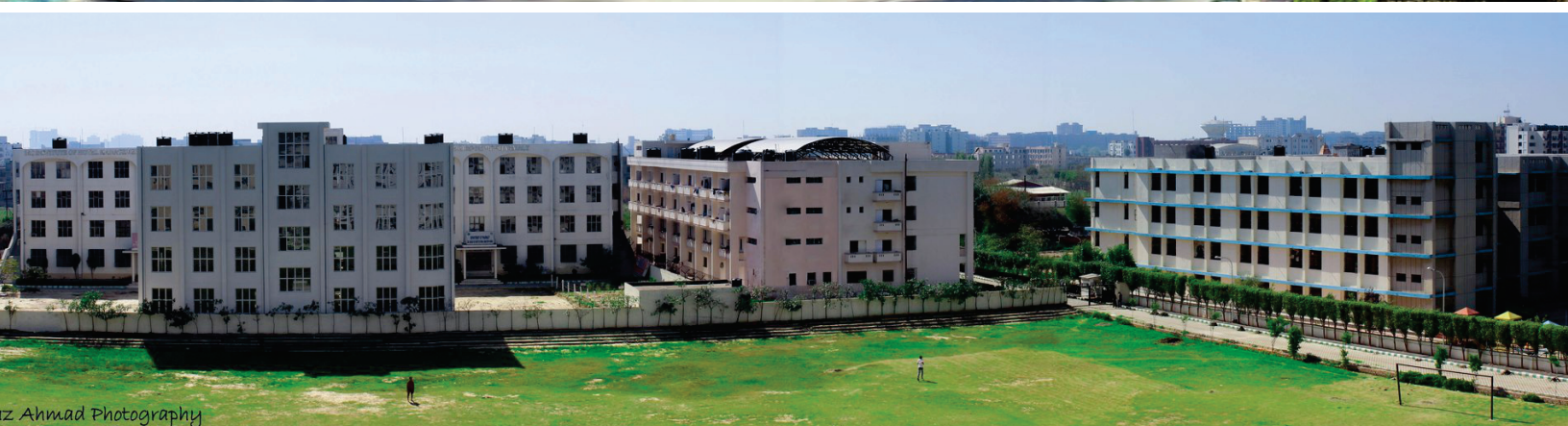
Fawaz Ahmad Photography