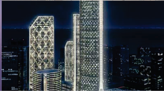
Tameer Tower, UAE