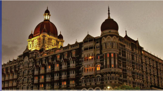
The Taj Hotel, Mumbai