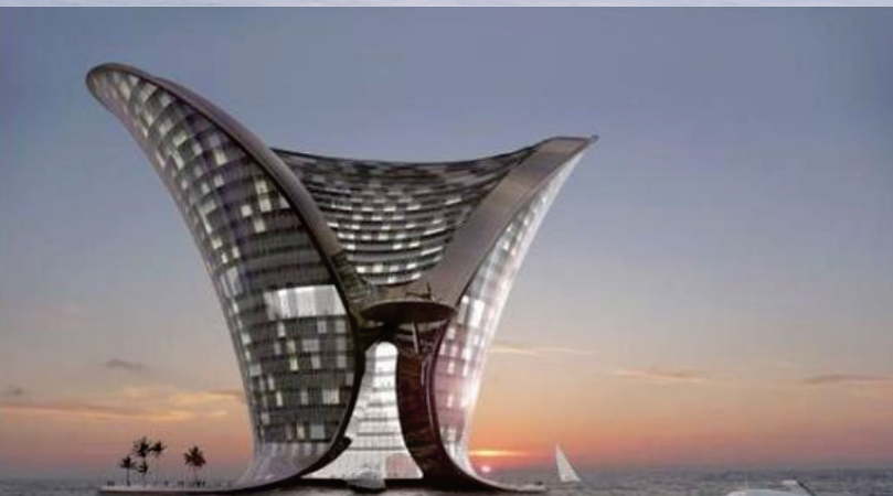
The Apeiron Island Hotel, Lebanon