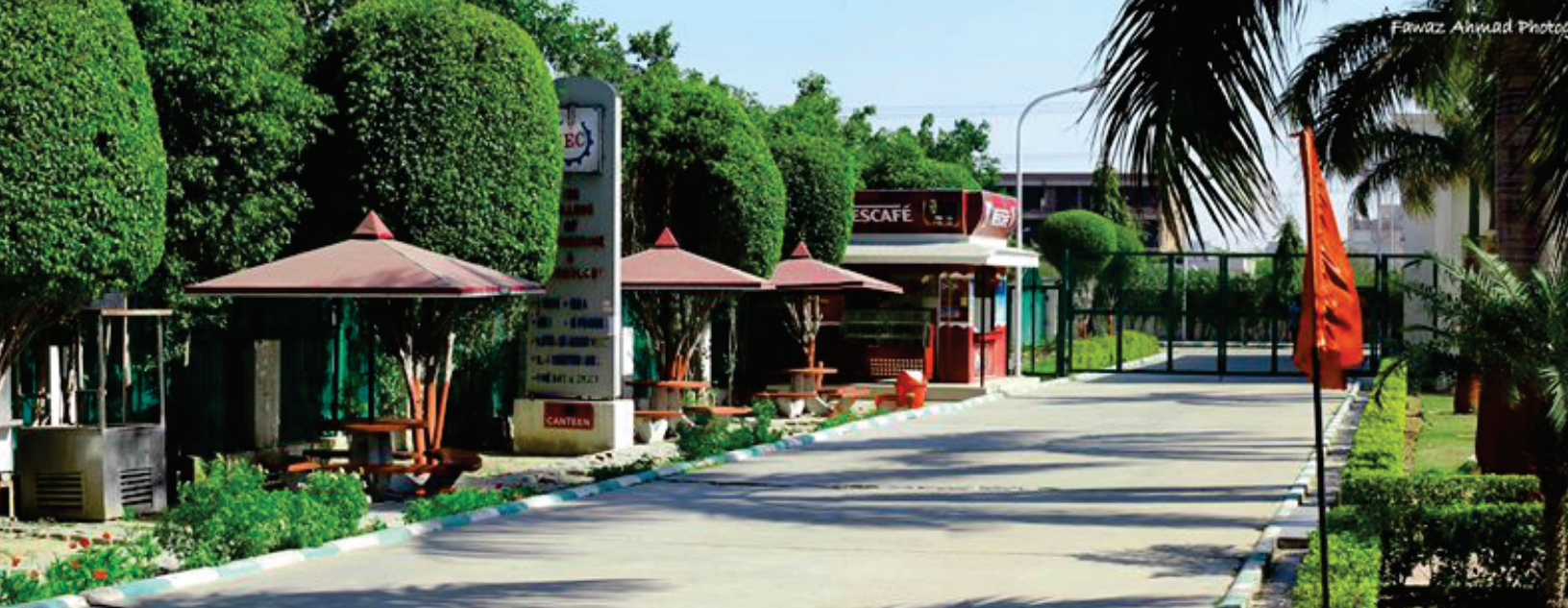
Fawaz Ahmad Photos