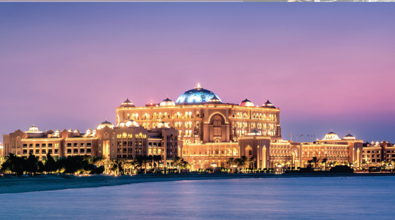
Emirate Palace, UAE