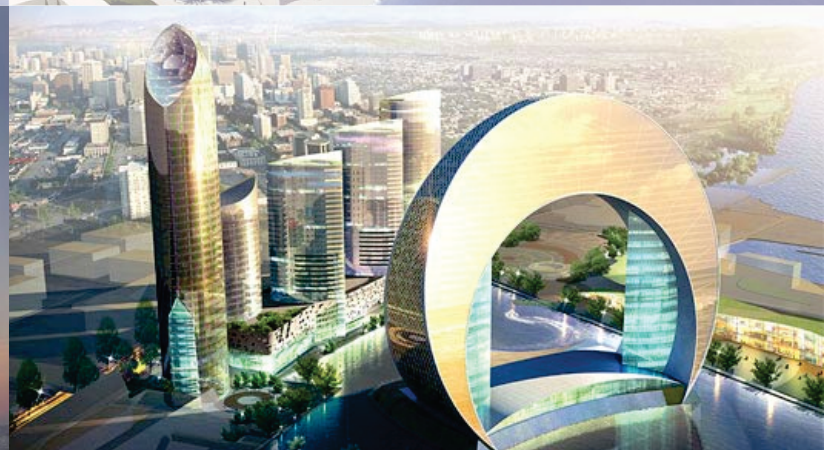
Full Moon Hotel, Azerbaijan